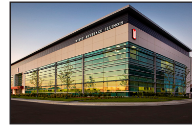
Wirtz Beverage Cicero, IL 600,000 square feet