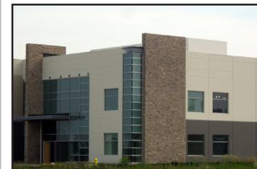
IDI Building A Antioch, IL 454,000 square feet