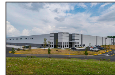
H&M BTS Burlington, NJ 546,000 square feet