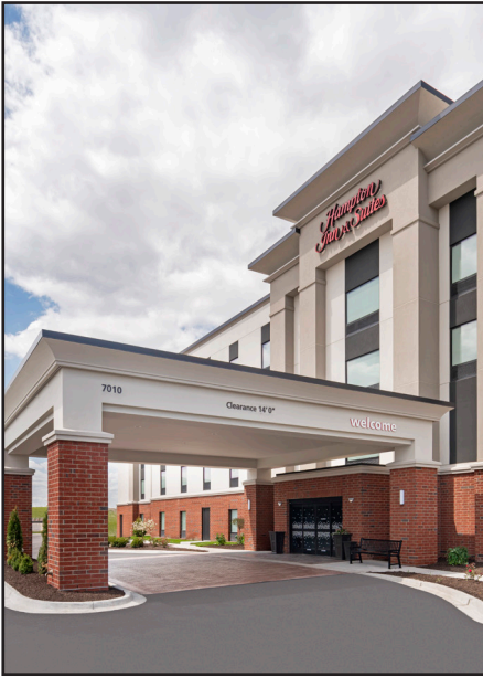
Jim's most recent project, Hampton Inn Bridgeview